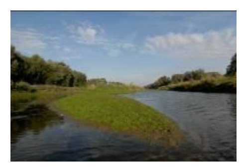
6 sidearms will be re-established in the project area.