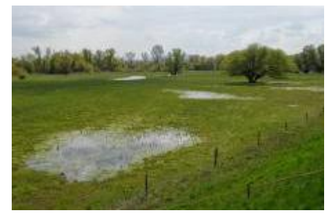
A net of water bodies with episodic stream flow ("Sutten") is habitat of amphibians and wading birds.