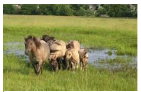
Extensification and re-establishment of the traditional land use by reintroducing of grazers